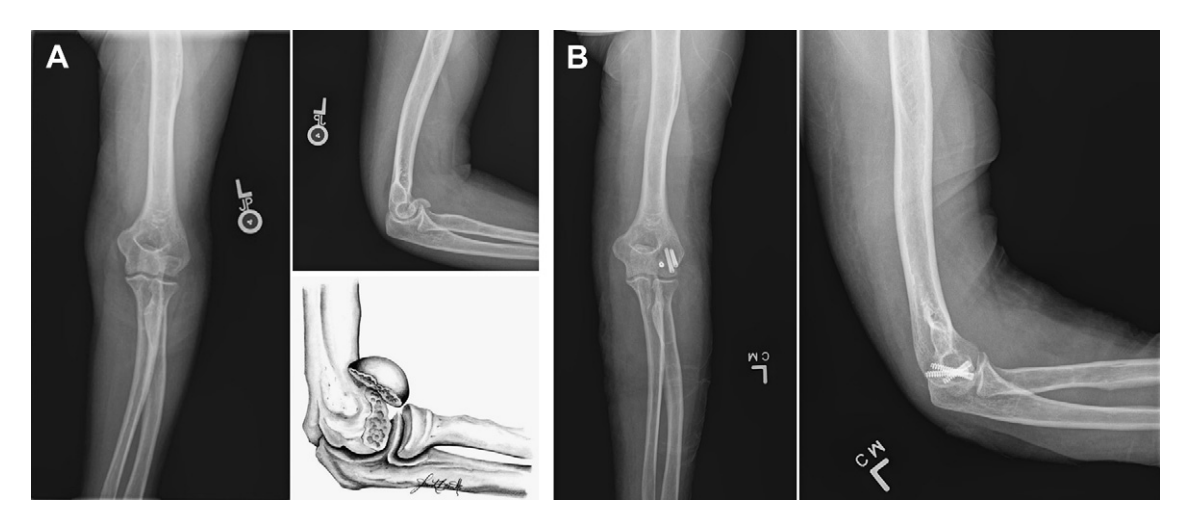
Figure 1 A , Antero-posterior x-ray view and lateral x-ray/diagrammatic views of a type-1A capitellum fracture. B , Antero-posterior and lateral views of the same patient 11 days after headless compression screw fixation.

LCL, lateral collateral ligament; OR, operating room; d, days; f/u, follow-up; m, months.