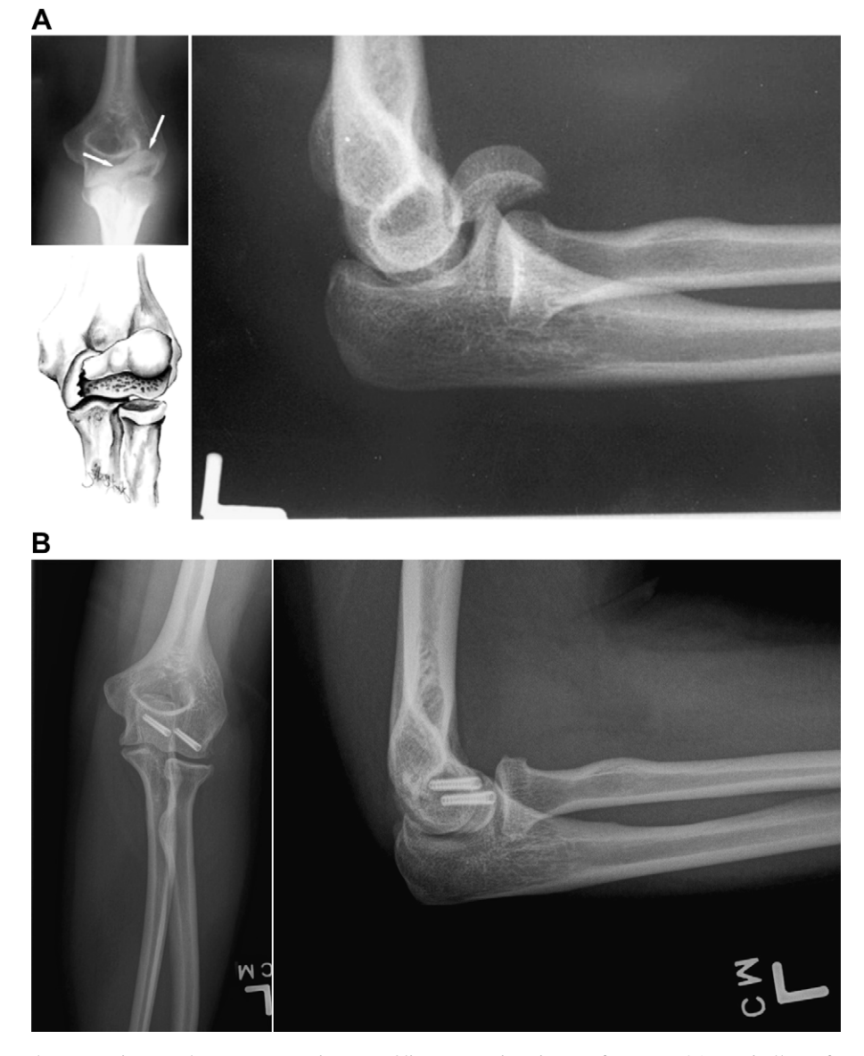
Figure 2 A, Lateral x-ray view and antero-posterior xray/diagrammatic views of a type-2A capitellum fracture. B, Ten-month postoperative antero-posterior and lateral views of a patient with a type-2A capitellum fracture fixed with headless compression screws.

rotational stability (Figure 1, B ). When possible, a divergent screw pattern was preferred. Furthermore, attempts were made to assure adequate screw spread to avoid iatrogenic fragmentation of the capitellum. Each screw was placed over the guide wire and countersunk for at least 2 mm to avoid erosion of the articular surface of the proximal radius from prominent hardware. Intraoperative fluoroscopy was used to examine hardware position and fracture reduction in the antero-posterior (AP) and lateral planes.